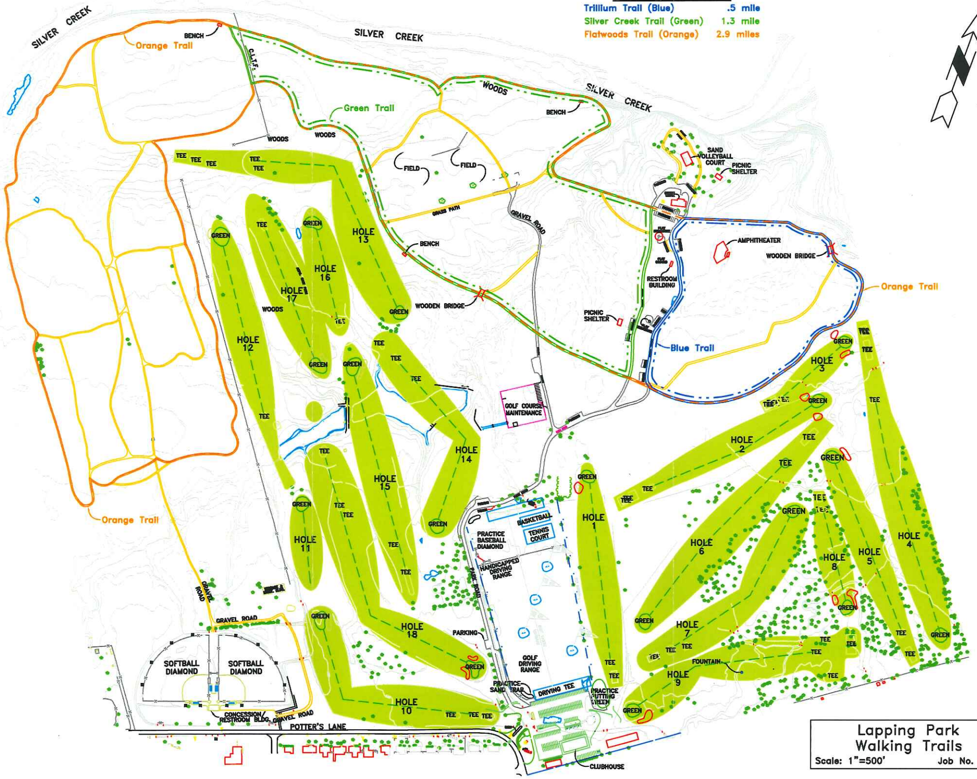
Lapping Park Walking Trails Scale: 1"=500' Job No. 0648